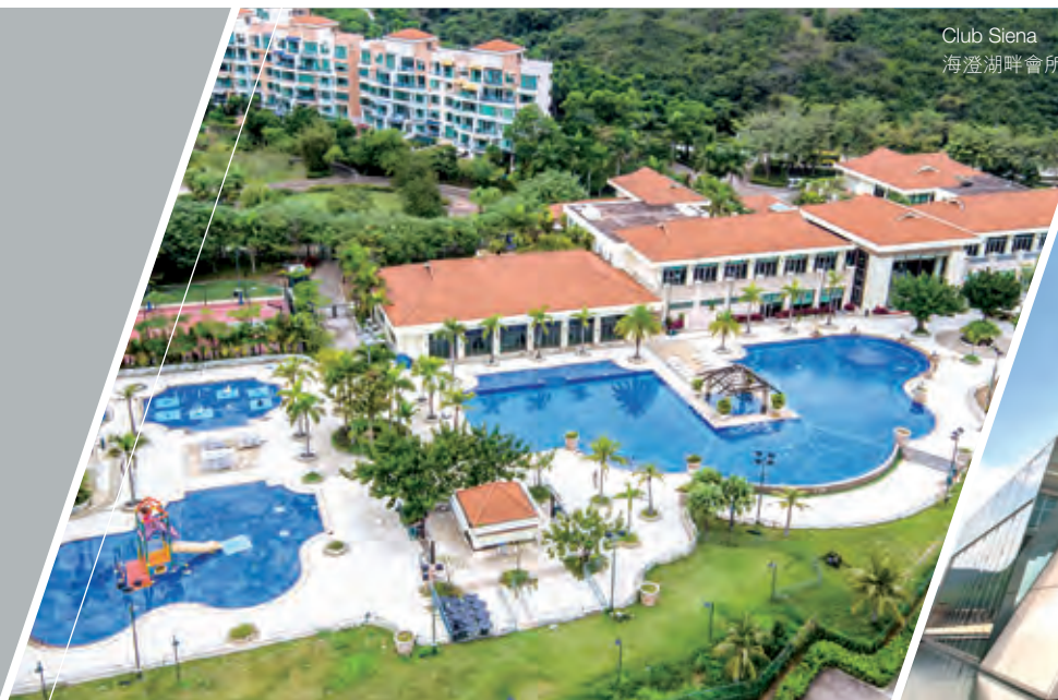
Club Siena 海澄湖畔會所