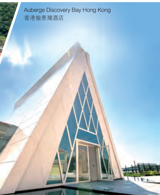
Auberge Discovery Bay Hong Kong 香港愉景灣酒店