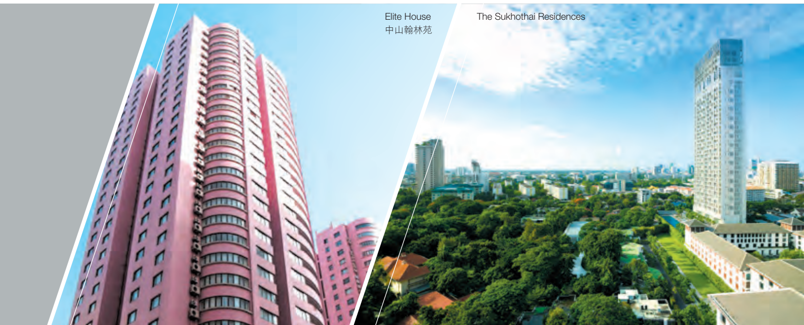
Elite House 中山翰林苑